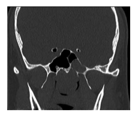
Figure 1. Contrast enhanced computed tomography scan showing the coronal section of nose and sphenoid sinus. Tumor is extending from the nose into the nasopharynx and left sphenoid sinus.

staghorn to inconspicuous. There is marked compression of vascular components by stromal fibrous tissue. Based on the histological findings, patient underwent embolization of the feeding vessel, in this case the left internal maxillary artery.