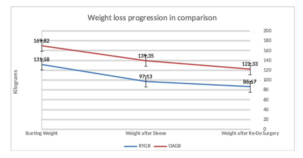
Figure 2. Progression of weight loss occurring in our study population after a secondary bariatric procedure.

Figure 2 describes the weight loss progression after a secondary bariatric surgery.