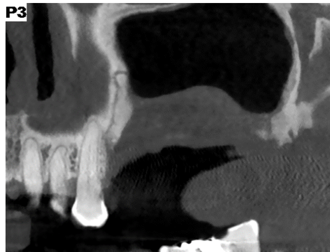
Figure 12. CBCT view at one year.