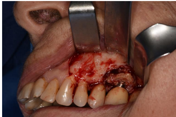
Figure 3. Full thickness flap elevation.