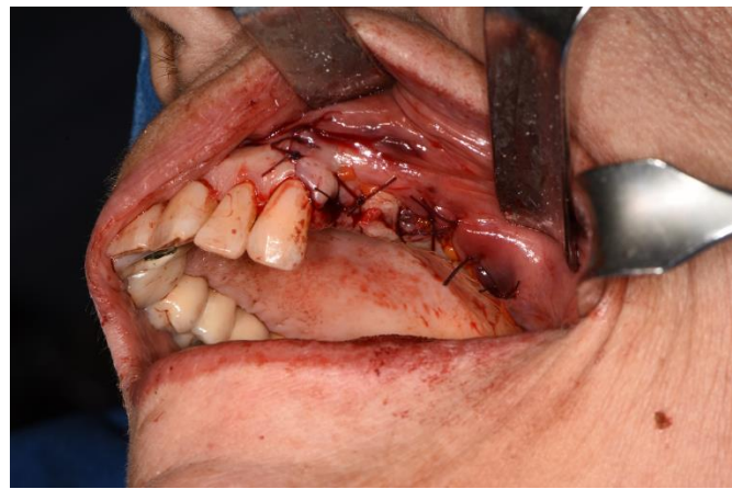
Figure 10. Double layer flap sutured.