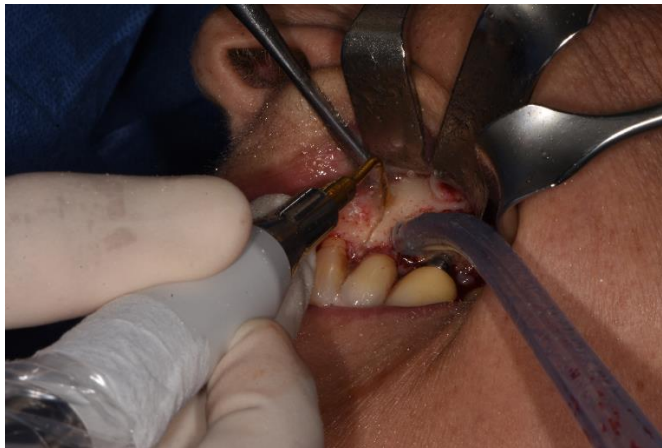
Figure 4. Osteotomy with piezoelectric device.