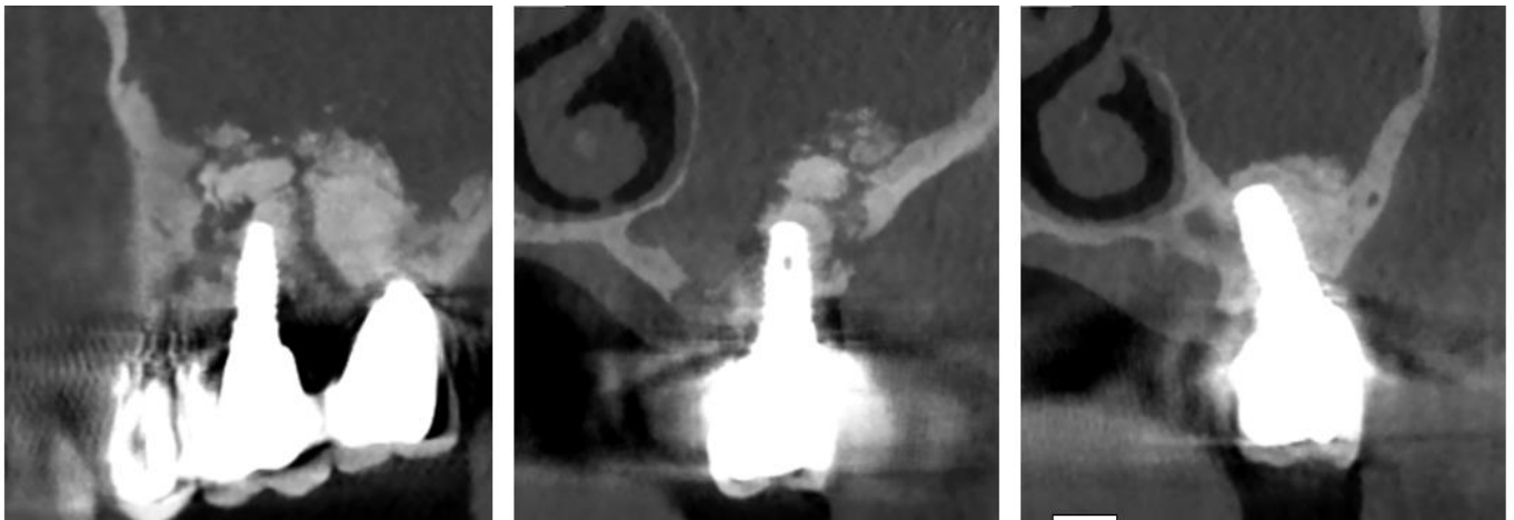
Figure 1. Preoperative CBCT showing a spontaneous bisphosphonates related osteonecrosis of the (upper) jaw in a patient with multiple myeloma treated with zoledronic acid (4 mg × 18 doses).

Informed consent was always obtained, privacy was respected the research was approved by the Ethics Committee for Clinical Trials (CESC) at Padua University Hospital (163n/AO/2).