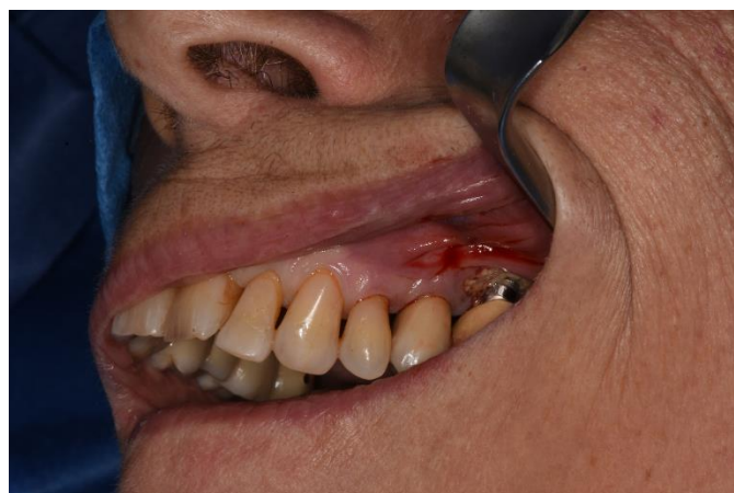
Figure 2. Clinical view.