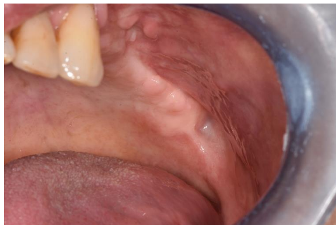
Figure 11. Clinical view at one year follow up.