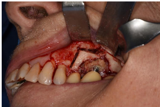
Figure 5. Osteotomy completed polypoid tissue in the maxillary sinus.