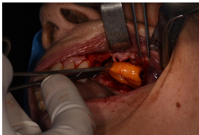
Figure 8. Buccal fat pad advancement.