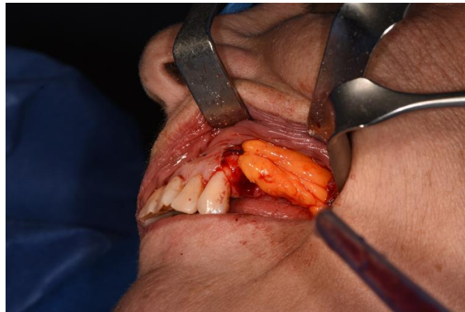
Figure 9. Buccal fat pad fixation.