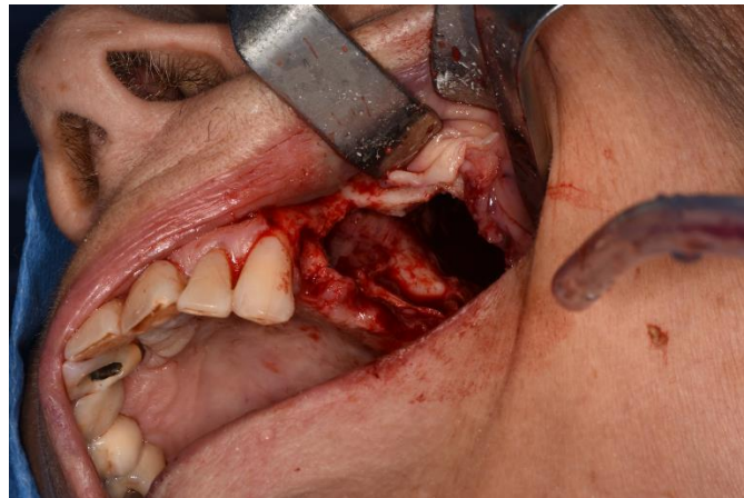
Figure 6. Maxillary sinus after gentle toilette without removing of Shneiderians' membrane.