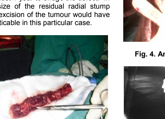
Fig. 3. Harvested fibular

Options such as bone transport and nonvascularised fibula strut graft to replace large bone defects has been reported in literature with varying degrees of success [1,2,3,4]. Limitations in resources, and possible complications associated with non-vascularised bone grafting [20] and bone transport has also been recorded [2]. In this particular case, it would have been almost impossible to harvest enough bone graft required to fill the defect as it would have required multiple harvests at different sites of the body. In addition, the choice of bone transport would also not have been possible as it would have taken almost 1 year to bridge the defect. In addition, the size of the residual radial stump after the wide excision of the tumour would have made it impracticable in this particular case.