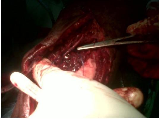
Fig. 4. Anastomosed vascular pedicle

highlighted [11]. In addition amputation for a nonmalignant lesion such as ABC would have been very distressful for both the patient and the managing team.