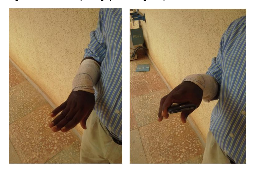
Figs. 7 & 8. 6 months follow up: Functional assessment

vascularised free fibular graft has been used by various persons to reconstruct extensive bone defects in the body with good outcome [14,15].