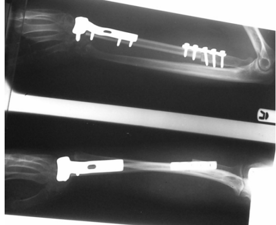
Fig. 5. Immediate post vascularised fibula transfer radiographs

The only other option available that was considered viable was the use of vascularised autologous free fibular graft. Autologous