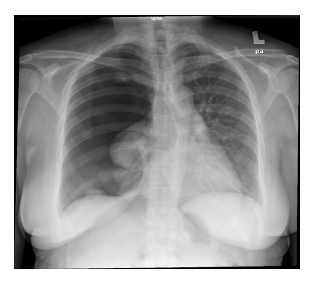
Fig. 1. Chest X-Ray at presentation of dyspnea. There is large right pneumothorax with a small well-defined right pleural base lesion seen which is fully surrounded by air suggestive that this lesion is separate from the right hemidiaphragm

gestation and delivered a healthy baby girl of 2.87kg with Apgar score of 9/10. Postoperatively, she was well and did not require any oxygen therapy. She was discharged home on post Caesarean section Day 3 with her newborn. She was offered right thoracoscopic surgery for excision of the pleural fibroma however she declined surgery. She has been seen at one-year post index pneumothorax and remains well. A chest X-ray done at this visit showed no interval change of the pleural lesion.