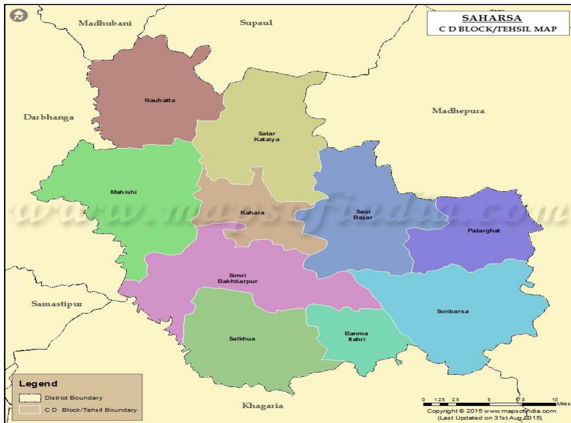
Fig. 2: Map of Saharsa district